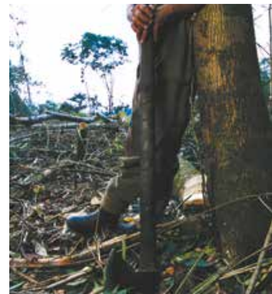
Below: Despite government commitments to halt forest loss, Peru's deforestation rate doubled between 2011 and 2012.

Unless Peru's government acts to address these underlying governance problems, its commitments to forest preservation and climate change mitigation will remain unfulfilled, and communities trying to protect their land and forests will continue to face lethal consequences.