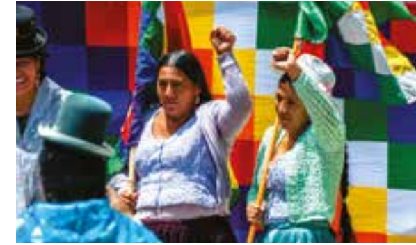
Below: The UN Climate Conference in Lima will put Peru's environmental and human rights record under the spotlight.

This crisis is poorly understood, and efforts to address it woefully inadequate. A lack of systematic monitoring means that publicly available information relating to violence against environmental and land defenders is hard to find and even harder to verify. Global Witness' attempt to quantify the global death toll should be considered a conservative estimate. This opacity is likely both a cause and effect of the culture of impunity that surrounds these deaths. Stunningly, only one per-cent of documented cases saw a conviction. National governments and judicial systems are routinely failing to protect their citizens from harm.