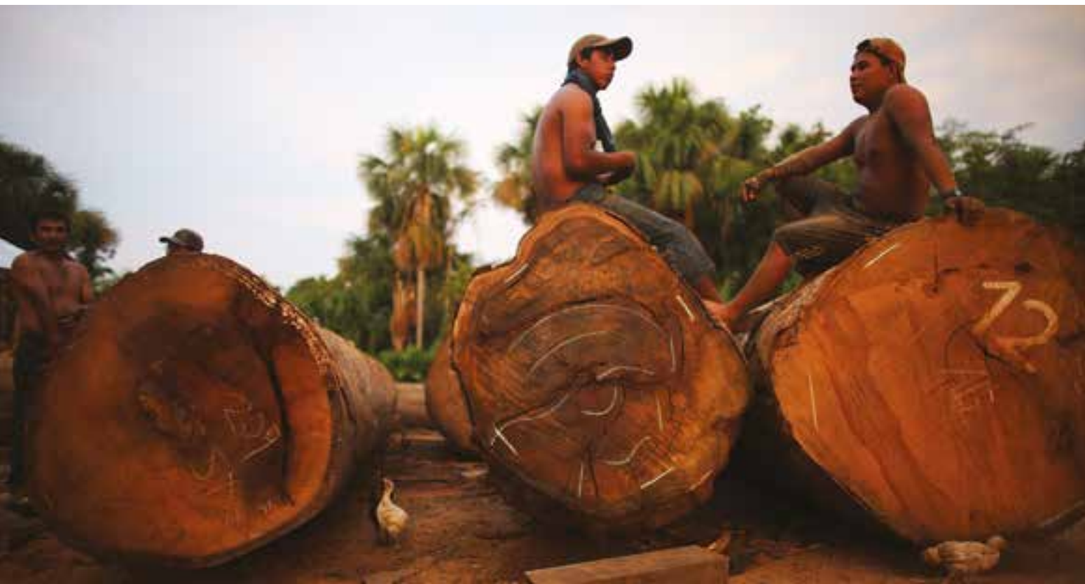
Right: Recent killings of environmental and land defenders in Peru are related to the struggle against illegal logging.