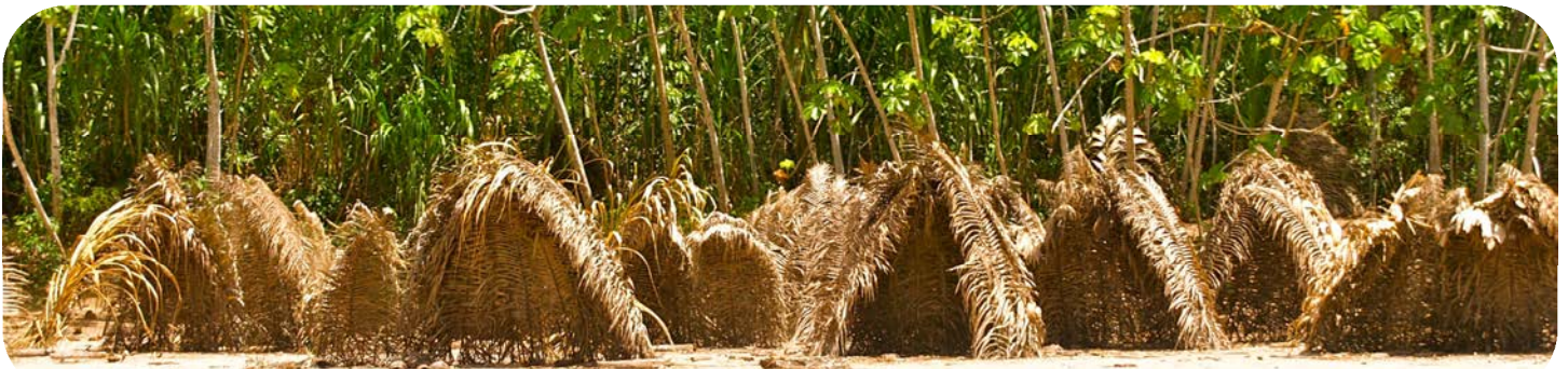
Shelters abandoned by isolated tribes inside Alto Purús National Park