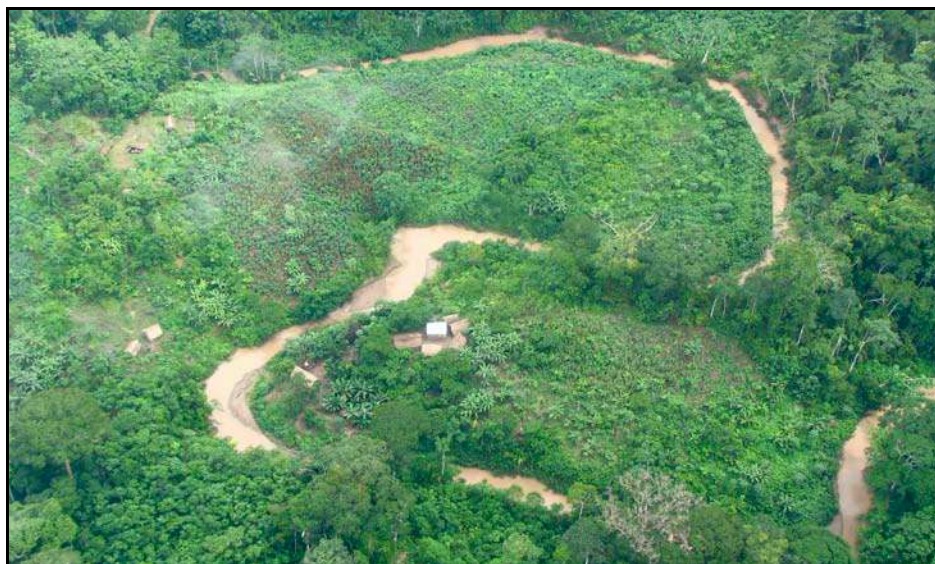
Photo A: Logging settlement in the headwaters of the Mapuya River near the border of the Alto Purús National Park inside the Murunahua Reserve

A large logging operation is based in the headwaters of the Mapuya River near the border of the Alto Purús National Park (see Photo A). Originally discovered by UAC in March 2009, an April overflight observed two large rafts of recently cut mahogany boards, indicating the settlement continues to be used as a transport center for mahogany illegally removed from the Reserve and Park.