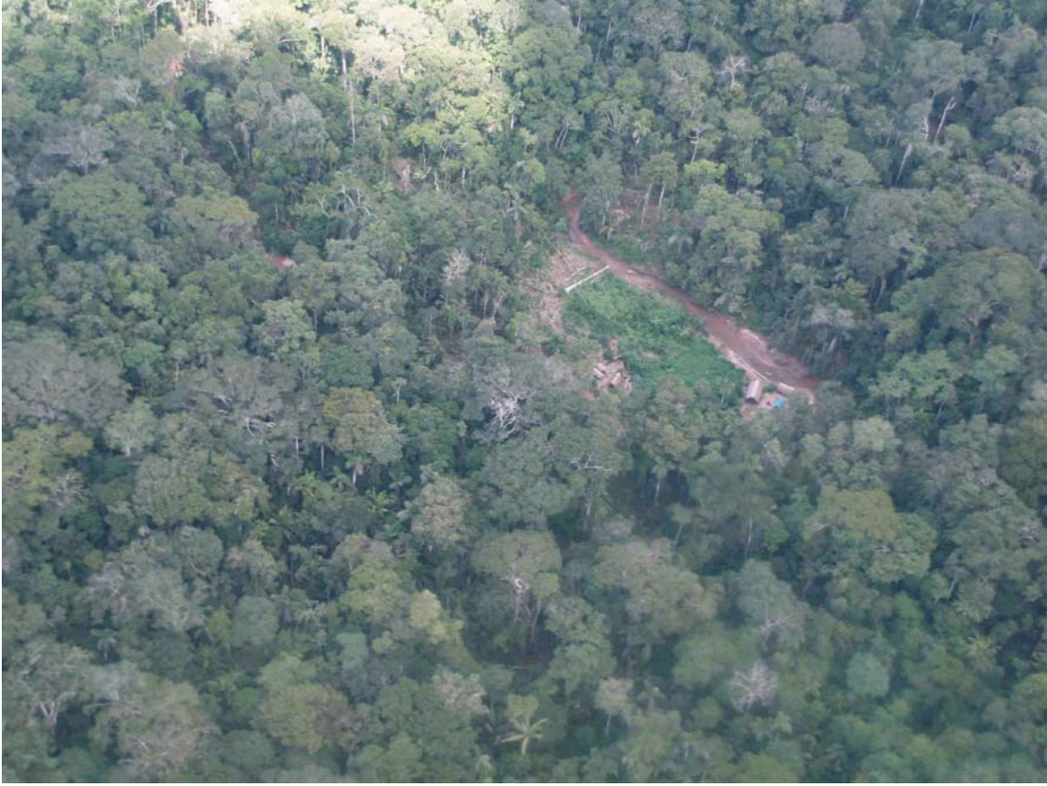
A logging camp inside the Murunahua Territorial Reserve near the boundary of the Alto Purús National Park (Photos: Chris Fagan 3/09)